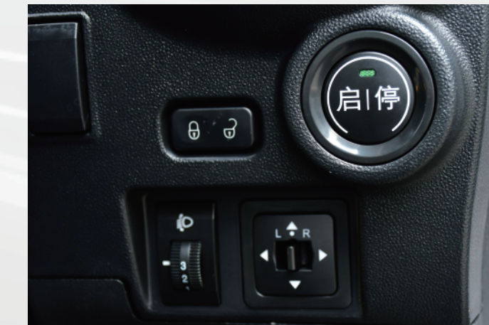
Engine Start & Mirror Adjustment Buttons