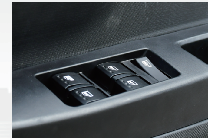
Window Control Switch