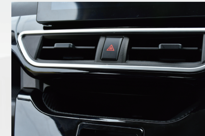
Center Air Vents