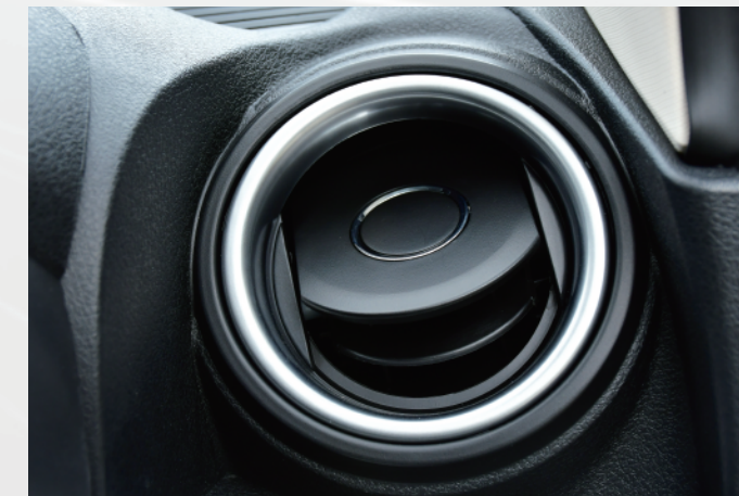
Air Conditioning Vents