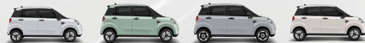
Glacier white Mint green Steel gray Velvet lilac